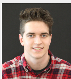
Rhett Kyle Wellness Produce Box