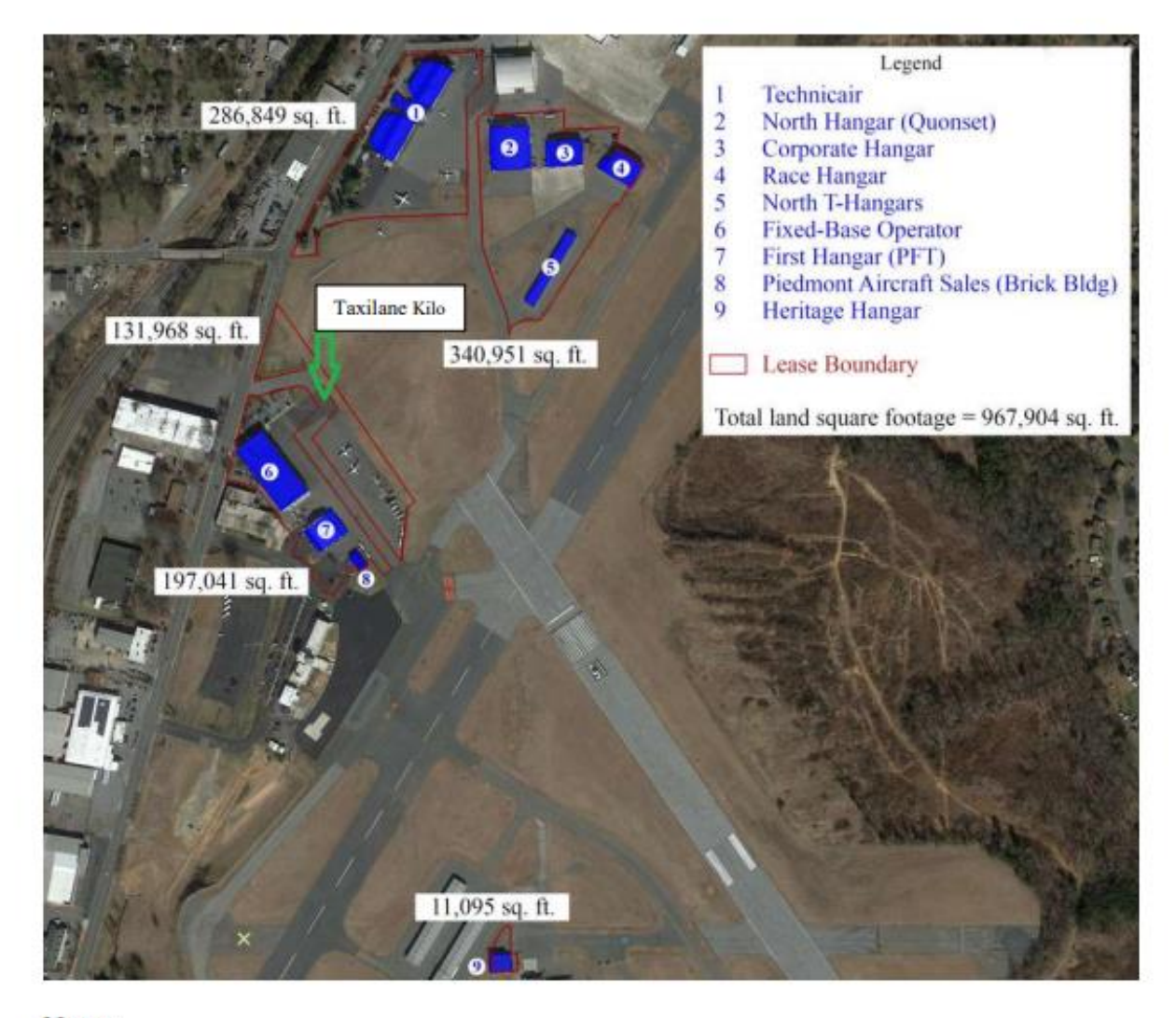
Exhibit A: Premises