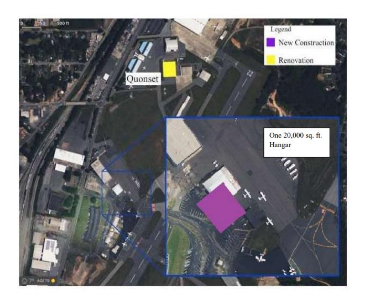
Exhibit B – Proposed Renovated/New Facilities